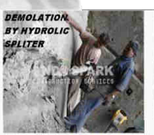
Demolation by Hydraulic Splitter -Koyana Dam Demo