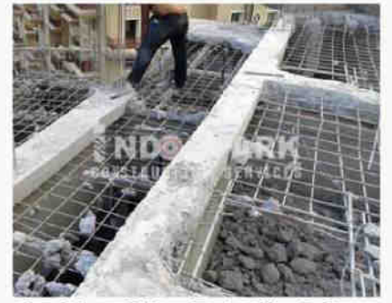
Breaking of Water Tank at Undri, Pune