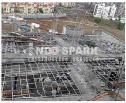
Breaking of Water Tank at Undri, Pune