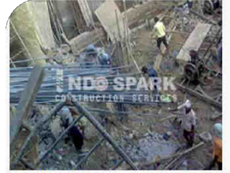
Breaking of Water Tank at Undri, Pune