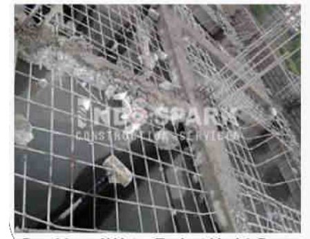
Breaking of Water Tank at Undri, Pune