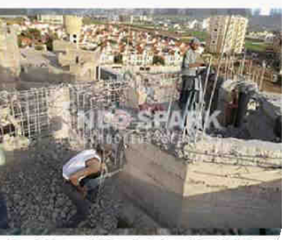
Breaking of Water Tank at Undri, Pune