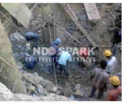
Pile Breaking at Mumbai