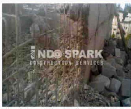
Breaking of Water Tank at Undri, Pune